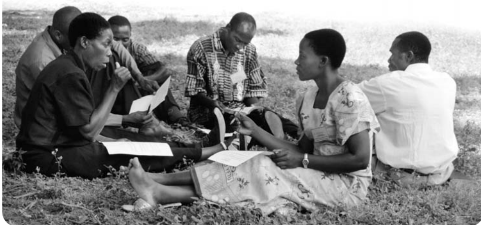
A small group hard at work on a Bible passage at the Tanzanian program, which met again in October. Preachers Clubs have now also been established in six towns in the country.